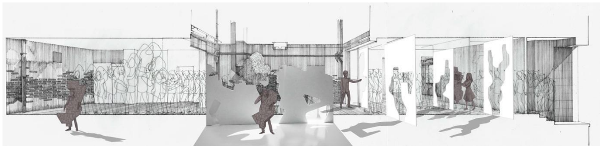
'I Am Where You Are'_